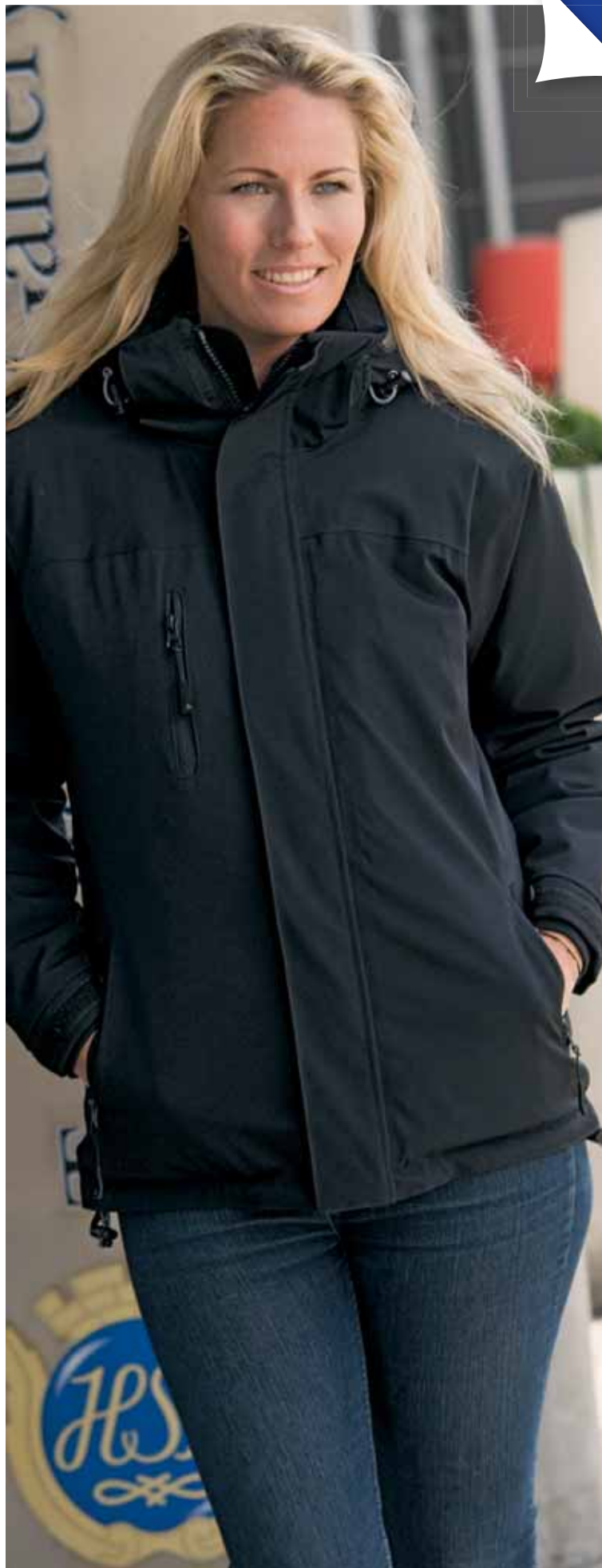
Technical insulated jackets